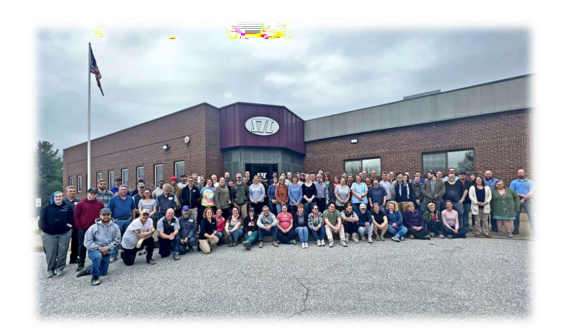
STC Hermetics Team