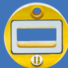
Hermetic Window Assembly Autoclavable hermetically sealed windows.