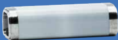
Implantable Ceramic Case Ceramic cases for medical implants and neuro-stimulators.

Specializing in hermetically sealed feedthroughs and windows for medical products.